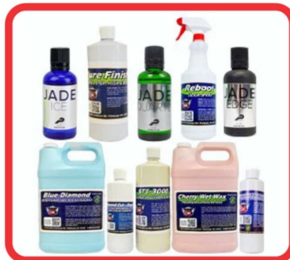
Car Detailing Items