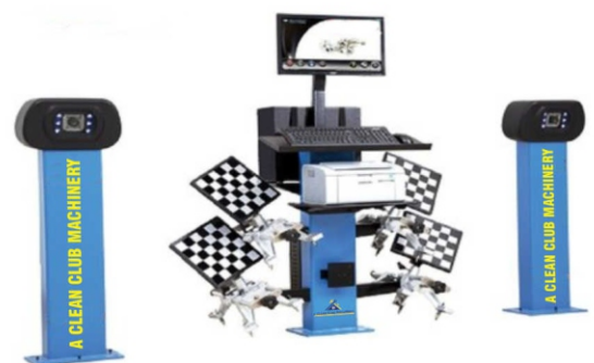
Model : FOX 3D DT

Drive Through model camera fitted with individual posts. More suitable for space constraint workshops giving access for free movement in shop without any obstruction due to horizontal beam.