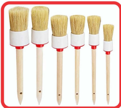
Car Detailing Brush