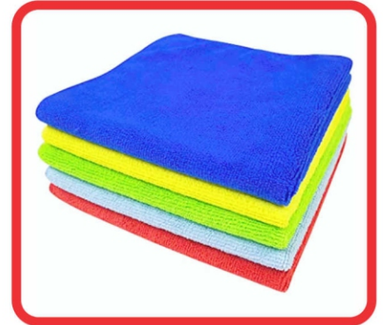
Micro Fiber Clothes