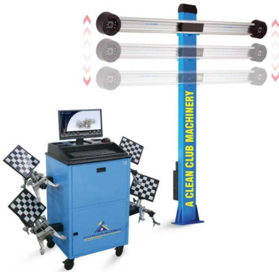
Model : FOX 3D Auto Boom

Automatic camera beam movement synchronized with movement of the vehicle on the lift. All measurements can be done at floor level and adjustments at any convenient level. Provision for manual height adjustment also.