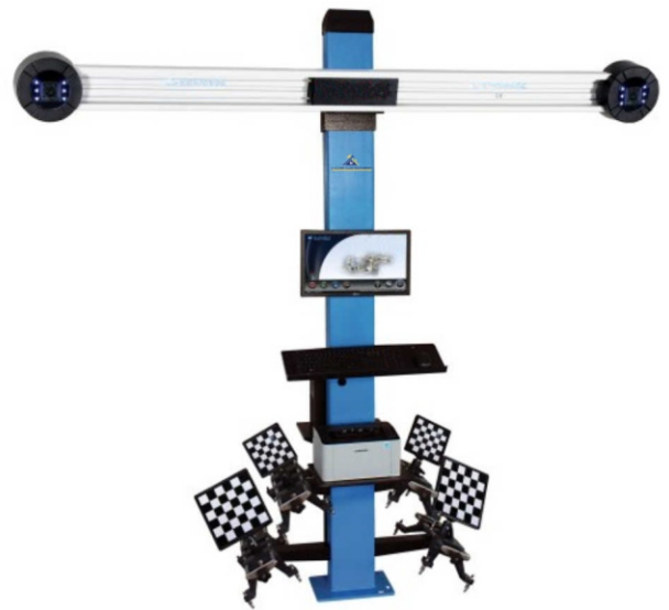
Model : FOX 3D VH

VH (Variable Height) - Horizontal beam with camera can be fixed at any desired level. Designed to perform alignment on Scissor lift, Four Post Lift and Pit.